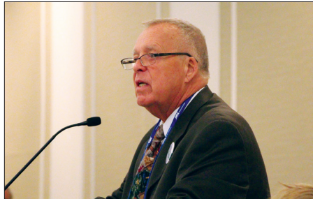
RMC Co-Chair Addresses the crowd at 2015 Retired Gathering.